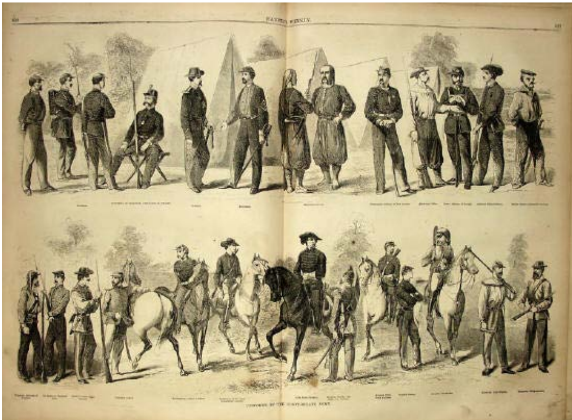
Variations in Confederate Uniforms, —Harper's Weekly, August 17, 1861