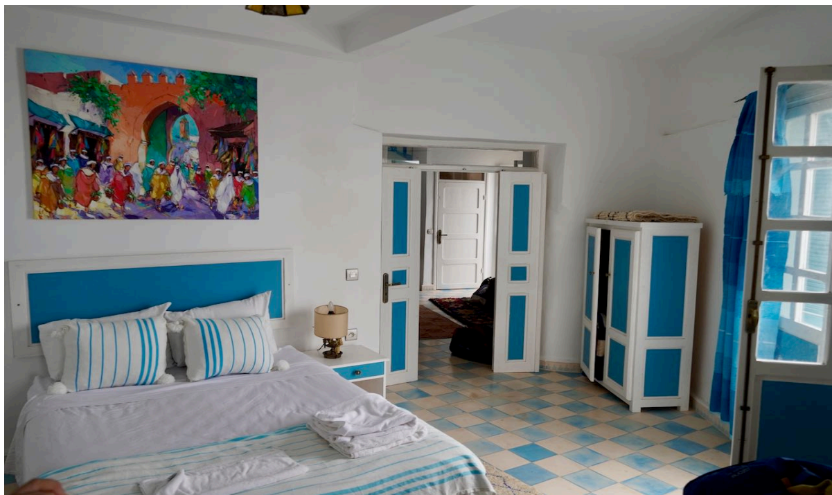
Doors open on to city wall and ocean. The window I am standing in front of also looks out on to the city wall and ocean.