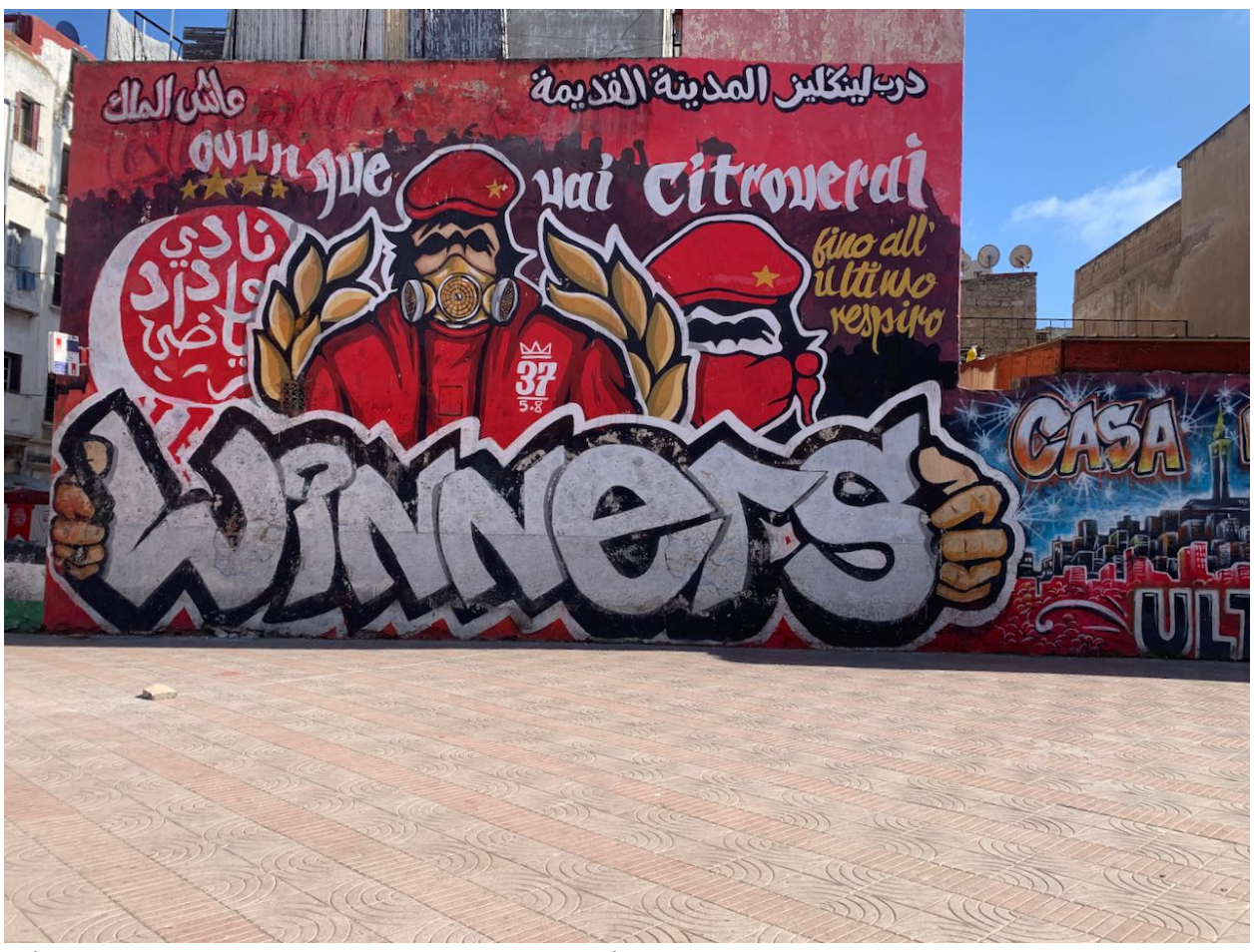
Advertising or street art – your guess is as good as mine.