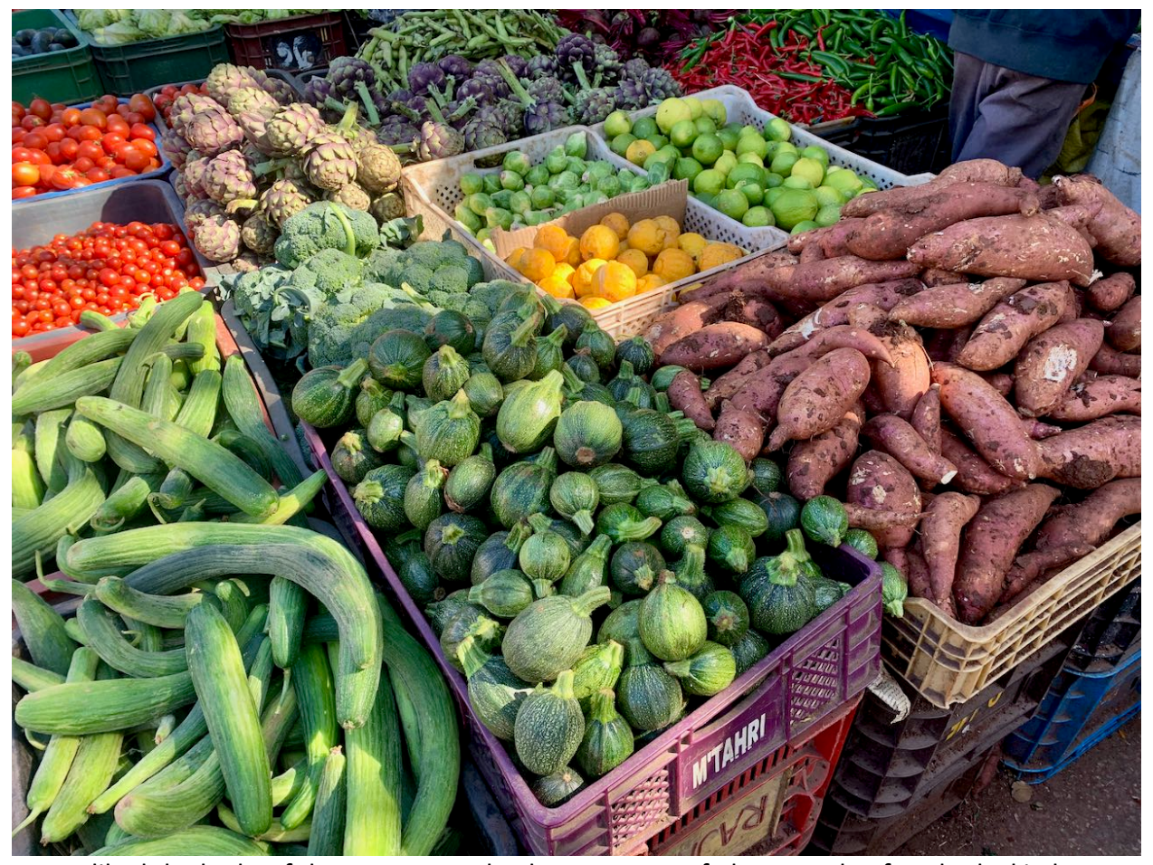
Nancy liked the looks of the green squash – lower center of photograph. If we had a kitchen, I am sure we would have tried the squash along with other vegetables and fruits.