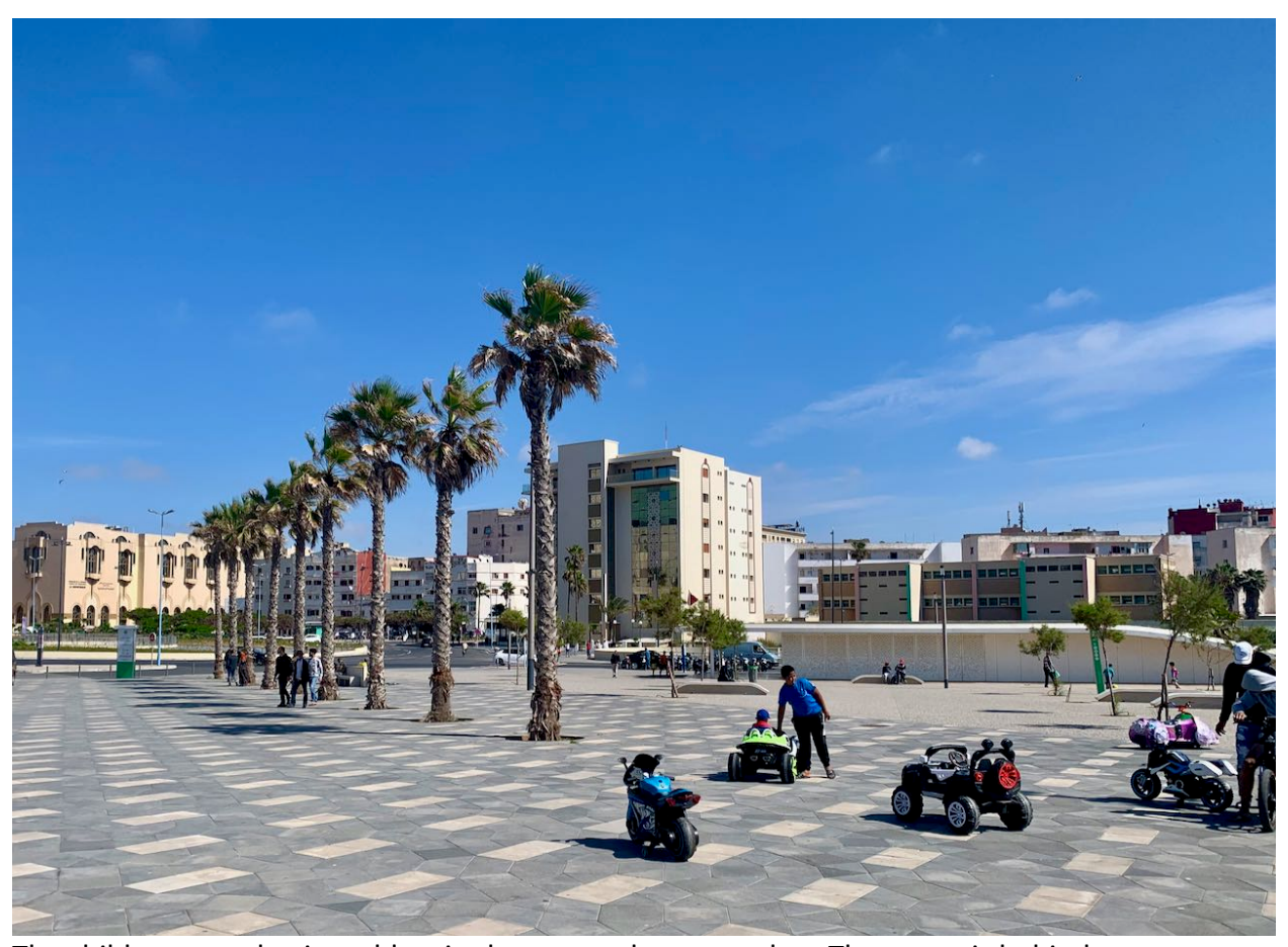
The children were having a blast in the cars and motorcycles. The ocean is behind us.

We spent a few minutes ocean and people watching before walking in the general direction of our hotel.