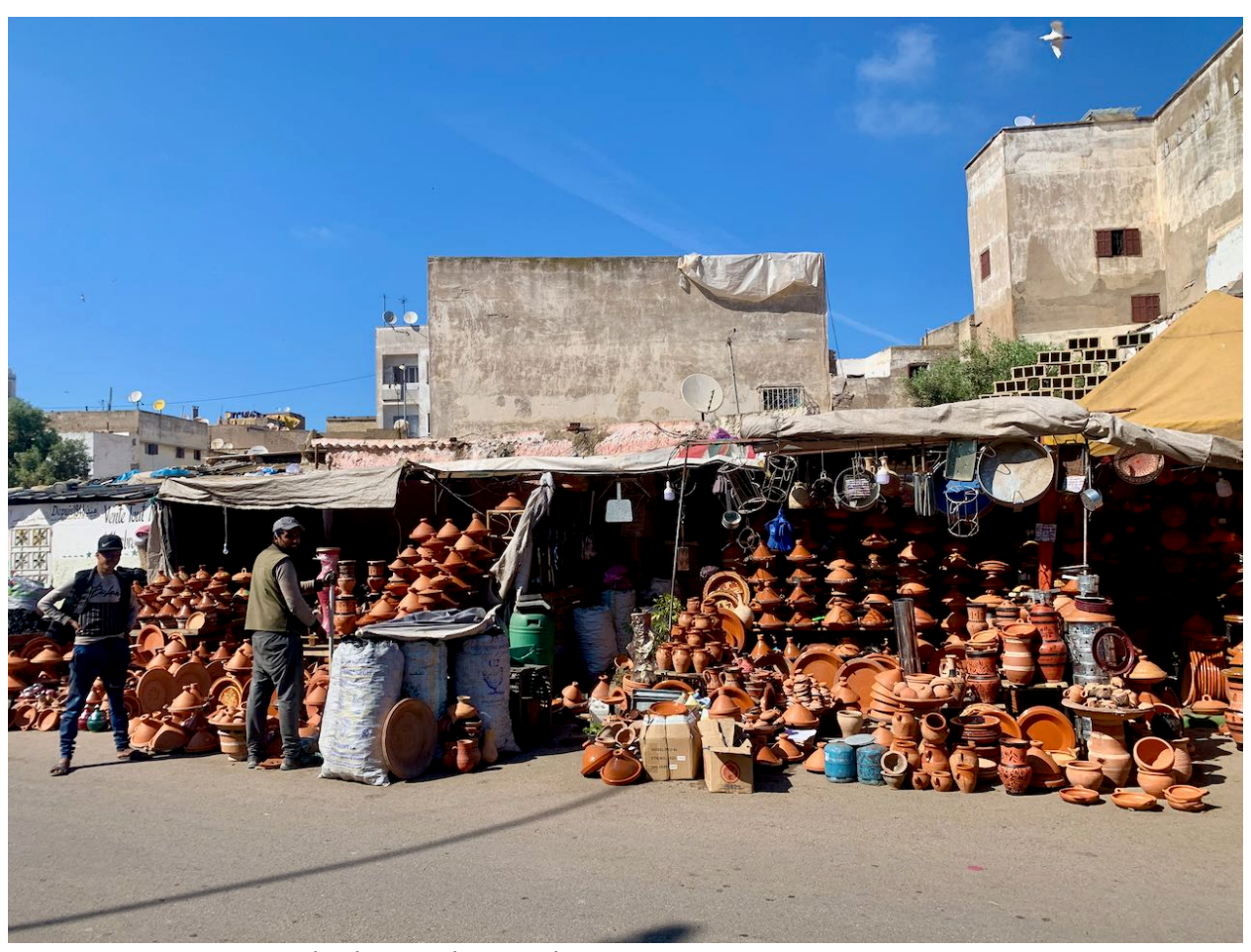
Ceramic tagine pots and other cooking and serving pieces.