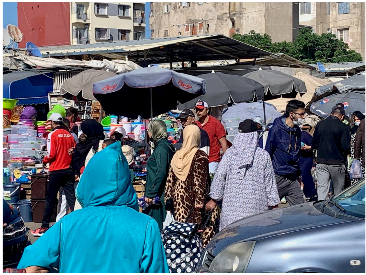
All of a sudden, the market was smaller and more crowded. As Nancy put it, "a super spreader event" if there ever was one. We were masked up and so were 50% of the people. We walked a half dozen blocks through the people while enjoying everything that was displayed for sale.