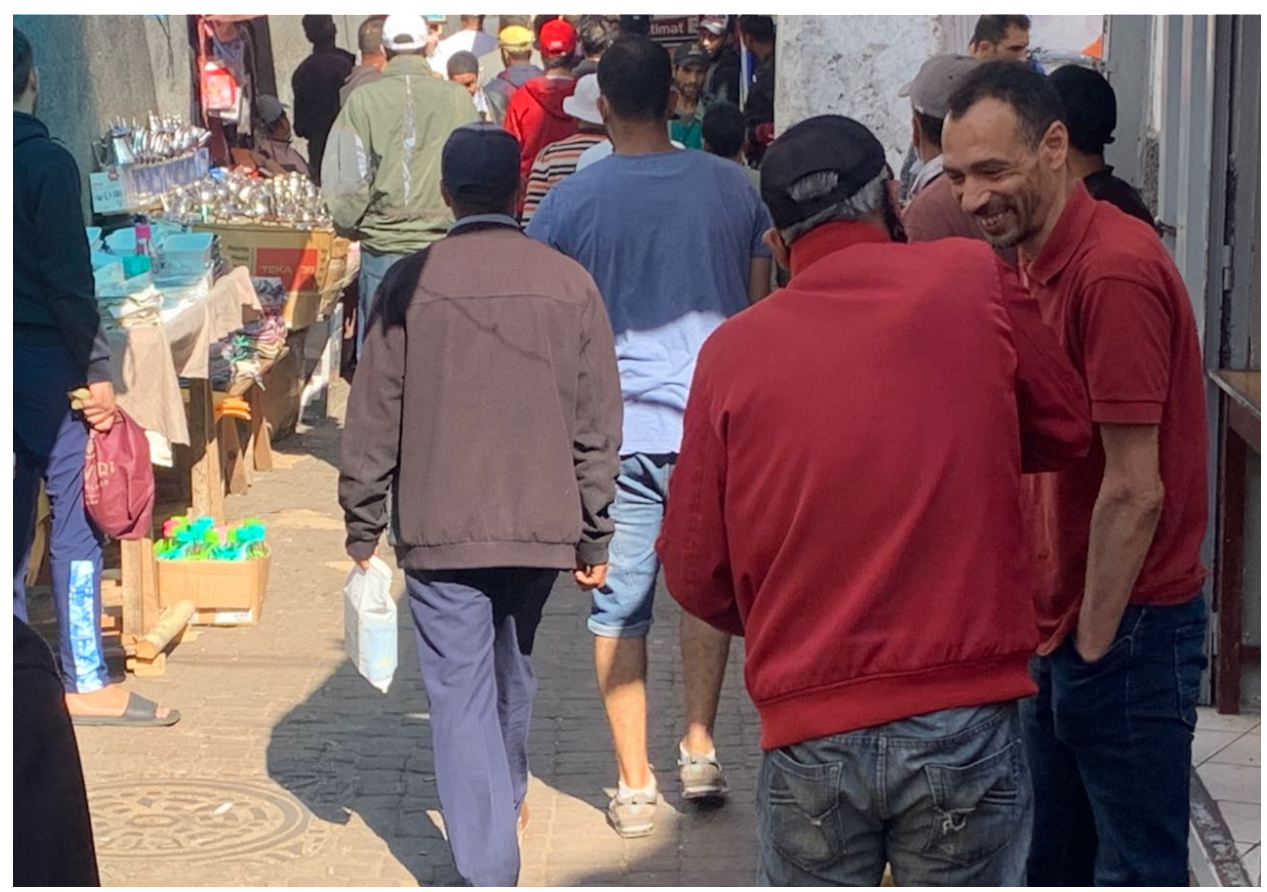
There is always time to talk.