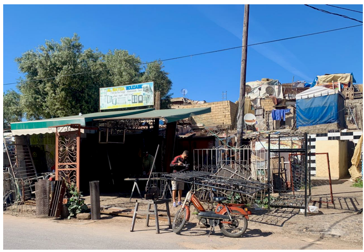
Need a fence or gate – this is the guy. He was welding as we walked by.