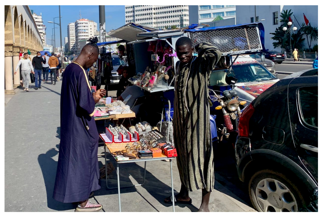
Focus on the man on the left's hair knot. I need a haircut, should I go for the knot look?

We had decided to exit the market and were back on a main street.