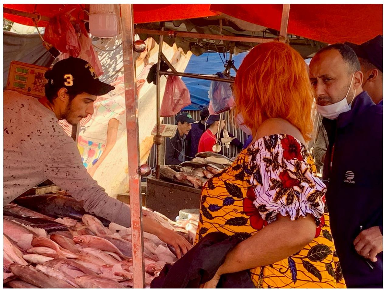
I wish I could have taken a better photograph of the women. She was much more than just her hair color.