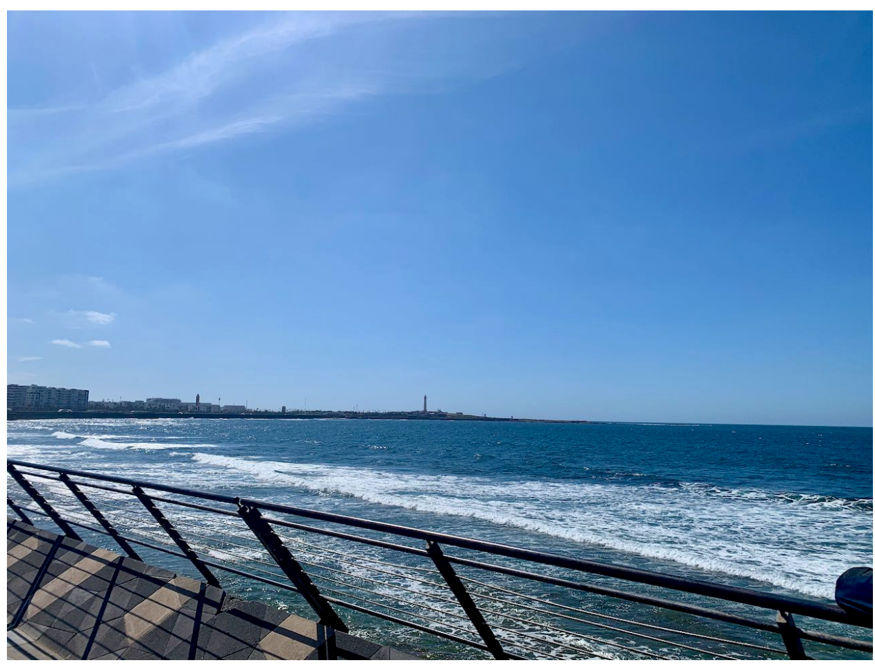
Beautiful ocean and sky.