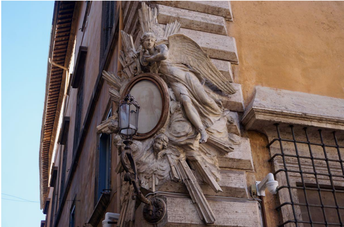
Colors of our street: