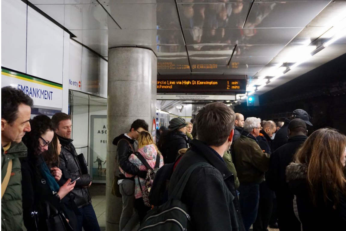
No seat for at least the beginning of my ride. Looking into the car from the station platform.