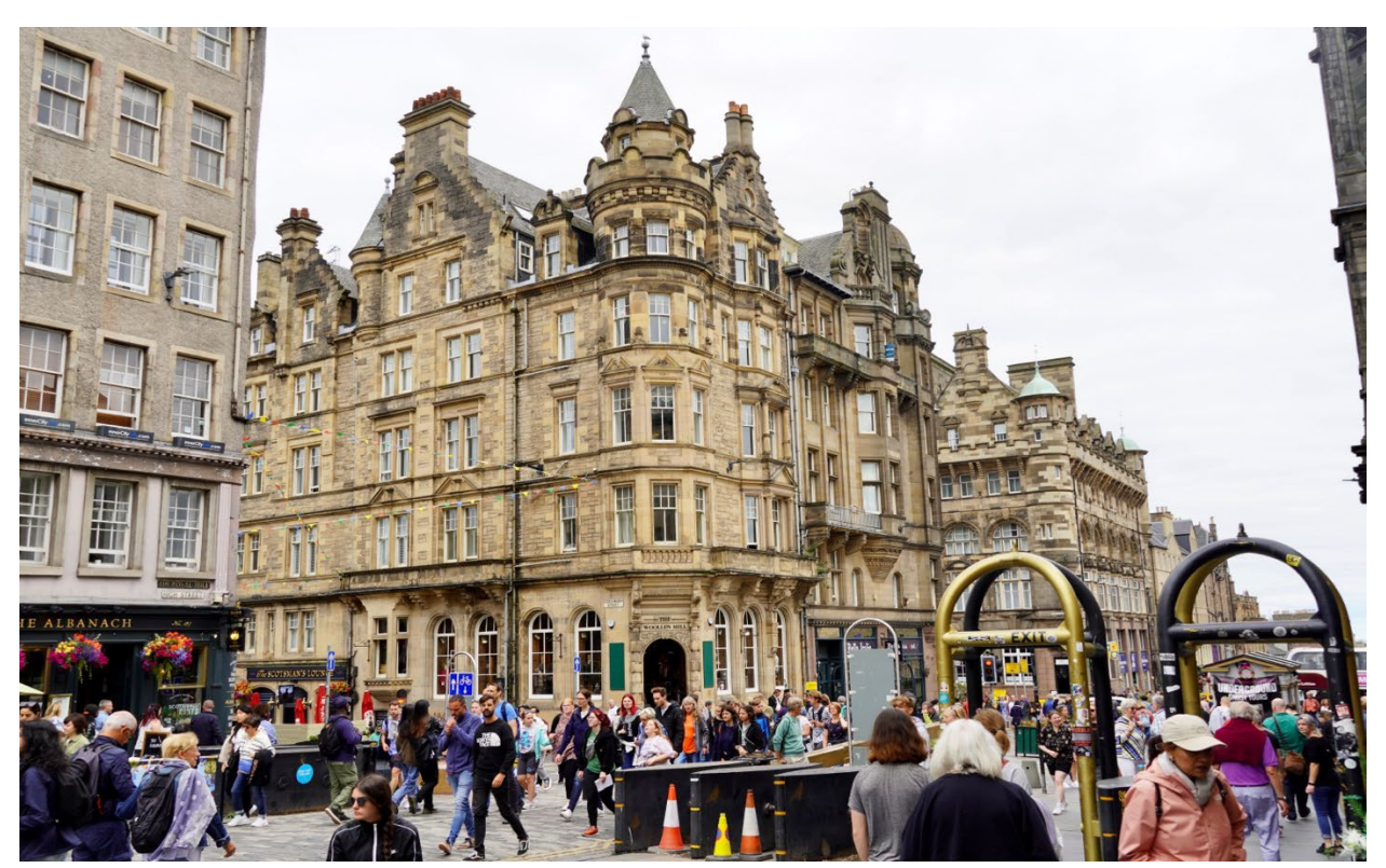
Buildings to be seen on the Royal Mile walk.