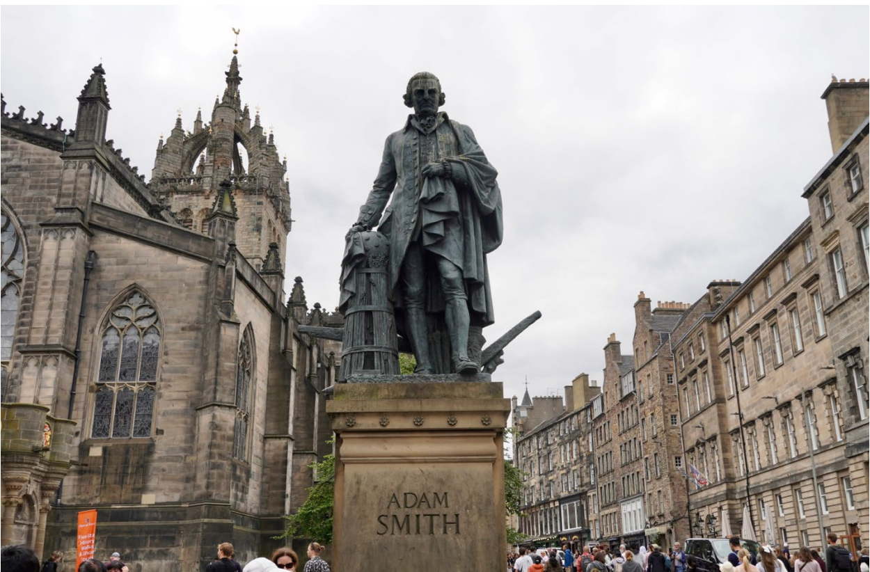
Adam Smith whose Wealth of Nations laid out economics of free market capitalism. Think "the invisible hand".