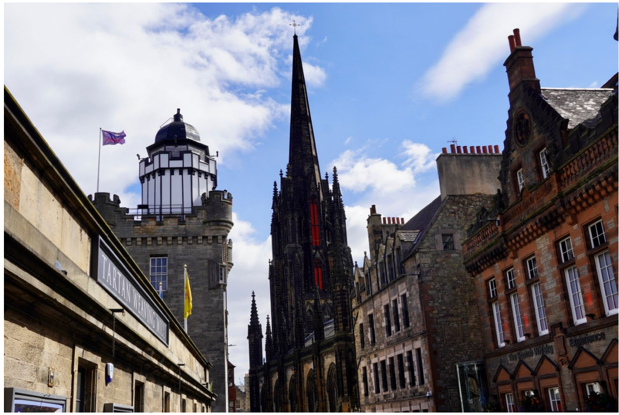
Looking down the street. The street name changes four times but is the same relatively straight downhill street.

I like the justice system for determining witches. If accused, you were tied up and thrown into a swampy lake. If you sank (and drowned) you were innocent. If you floated, you were guilty of being a witch and burned at the stake.