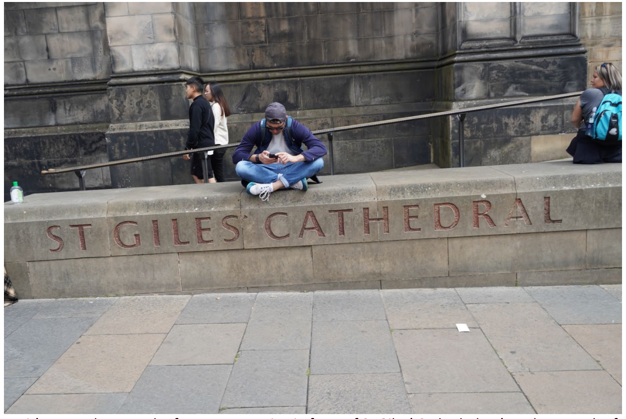
No it's not a photograph of someone texting in front of St Giles' Cathedral. It's a photograph of a scotch bottle – far left. After all we are in Scotland.