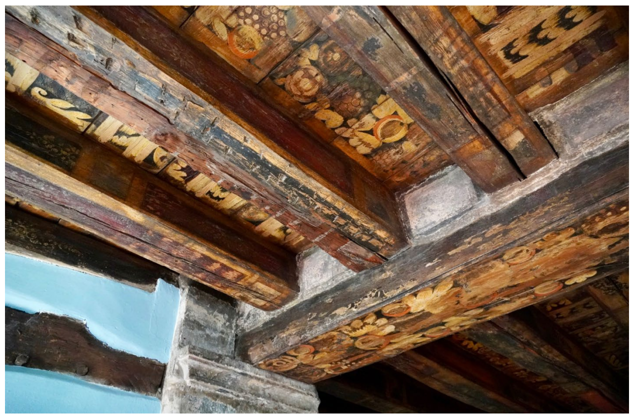
As a come on for higher rent, the Gladstone's Land's ceilings were painted. As the day got older the street got more crowded.