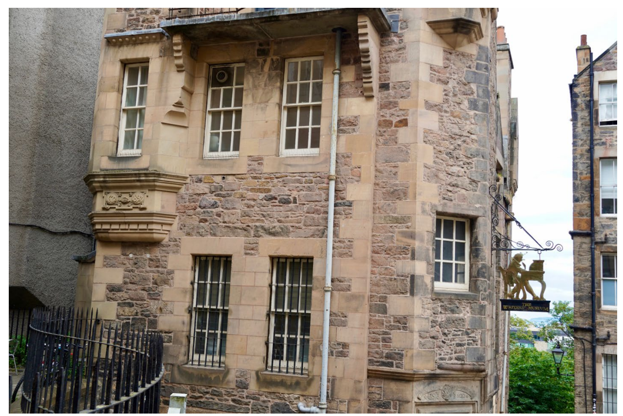
On a side street is the Writer's Museum – great find, it's free.

The Writer's Museum is housed in a house built in 1622. It houses books and artifacts of Scotland's three greatest writers: Robert Burns, Robert Louis Stevenson and Sir Walter Scott.