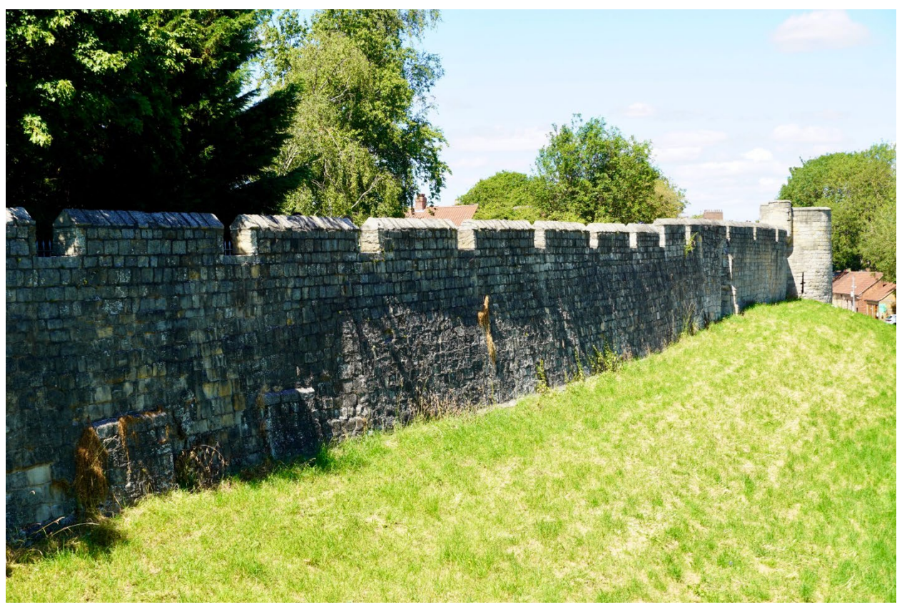
Looking at the exterior of the city wall.