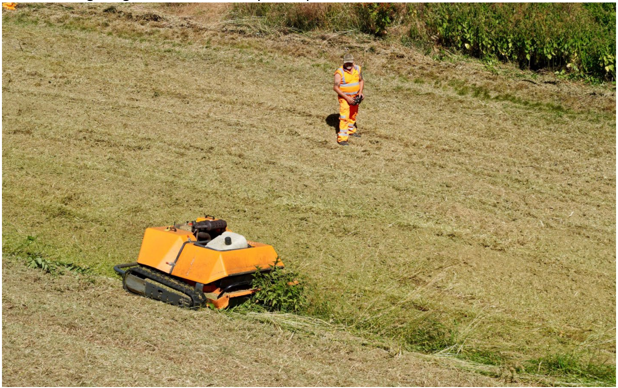
Not everything in York is old. Mowing by remote control.