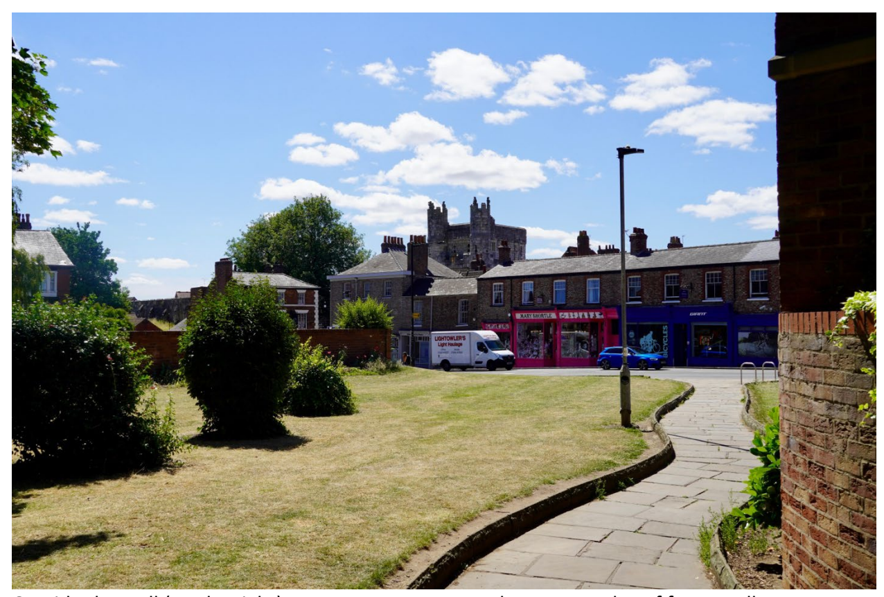
Outside the wall (on the right) to our apartment complex – a complex of four small apartments.

We are in York; luggage is in our apartment and therefore it is time to go exploring.