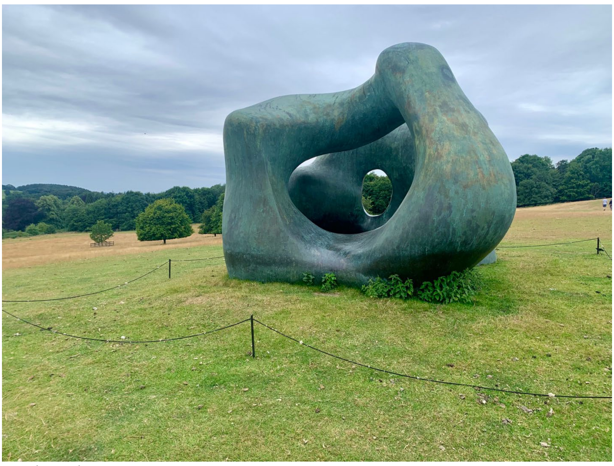
A sculpture by Henry Moore.

After more than an hour and half of cross country hiking to see various sculptures my pint of beer at lunch was a necessary pain killer.