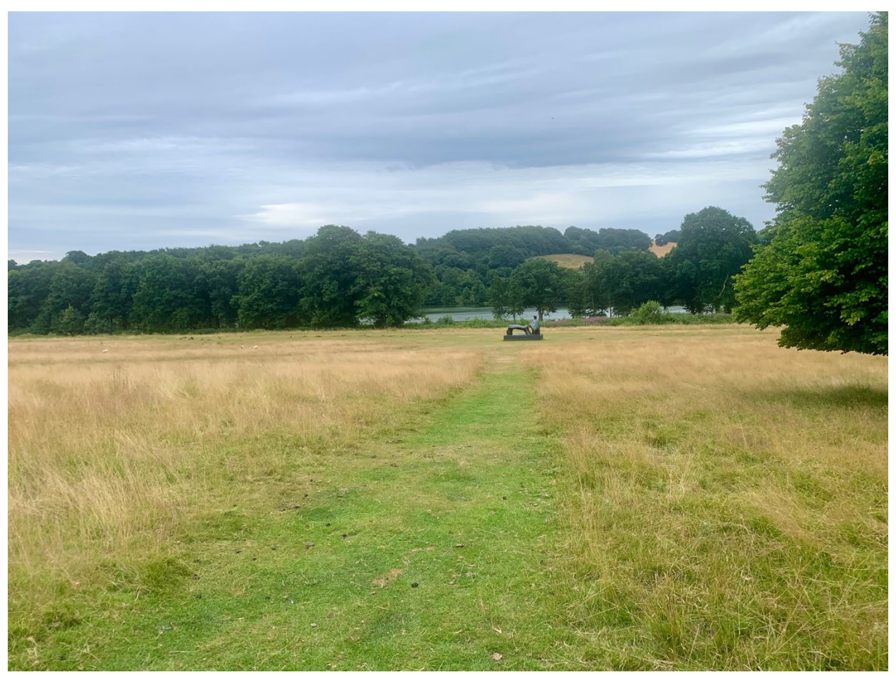
Grass lands, a Henry Moore sculpture, trees and a lake.

We stopped to take in various but not all of the sculptures at Yorkshire Sculpture Park. The Sculpture Park covers 200+ hectors/500 acres. My legs are getting stronger but today they are not ready to walk 500 acres of open fields.