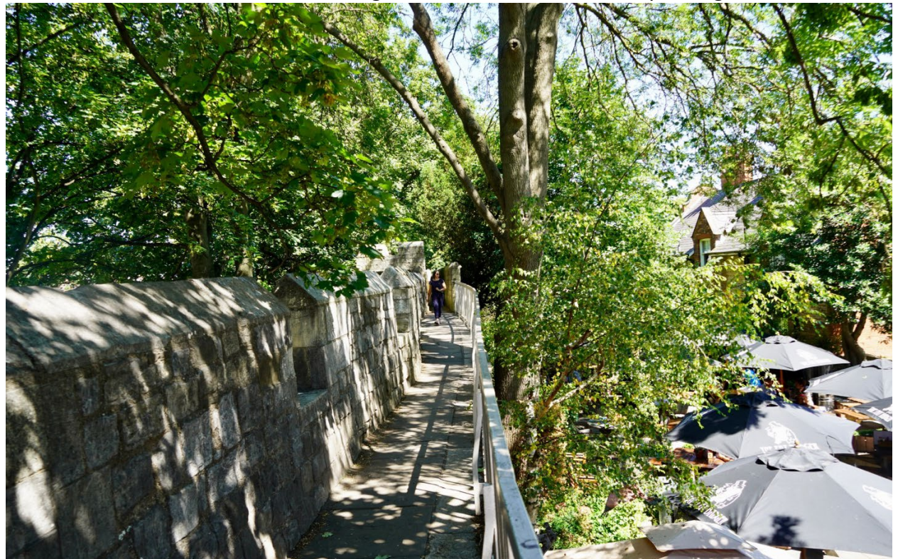
I'm back walking the City Wall.