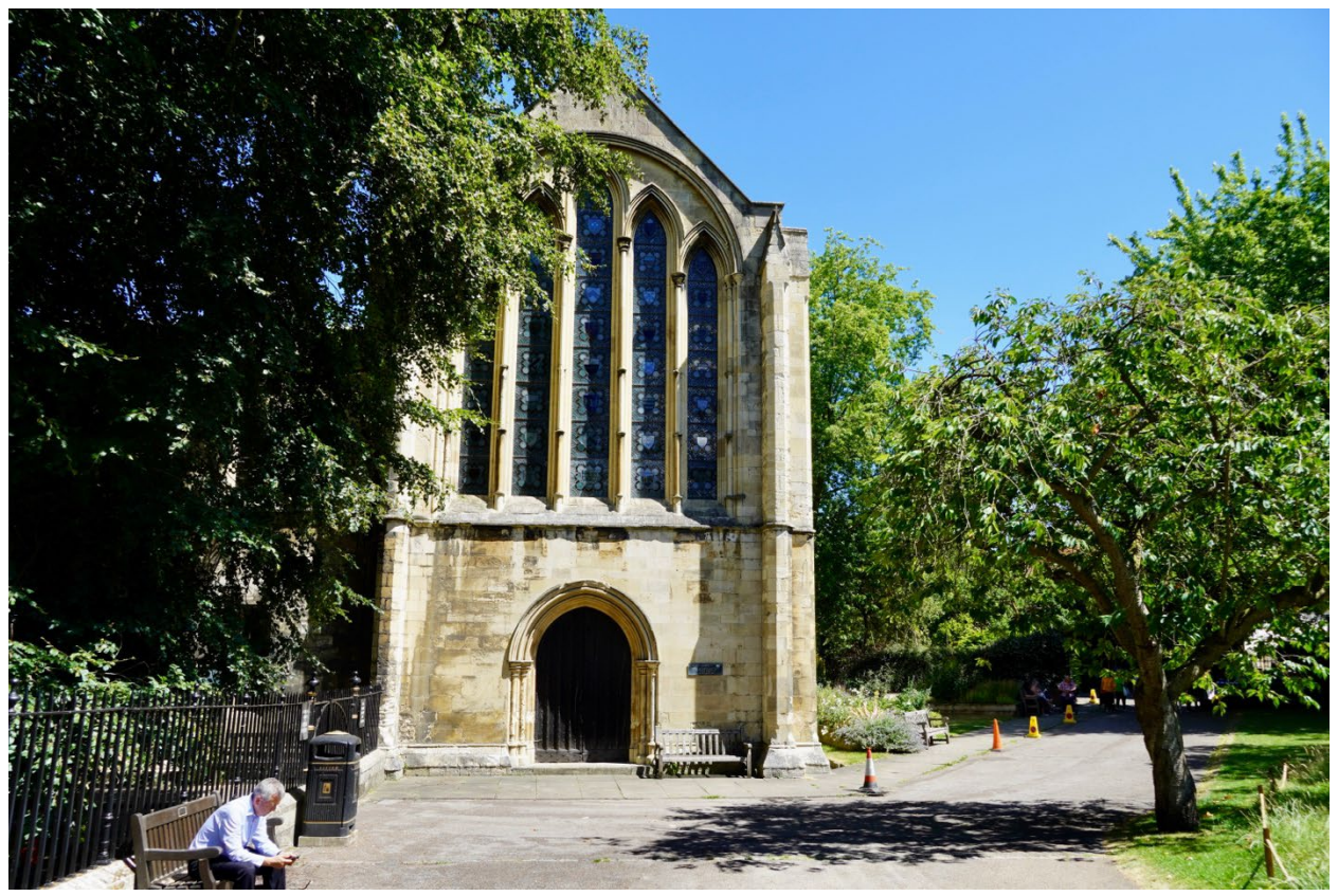
The Archbishop's Palace behind the Cathedral.