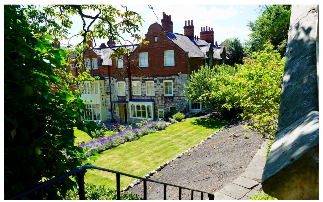
A private gate at the bottom of the handrail and stairs leading to the City Wall.