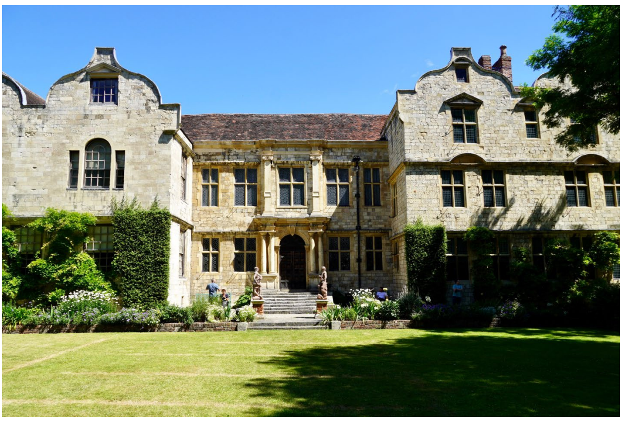
Treasurer's House is located behind the Cathedral.