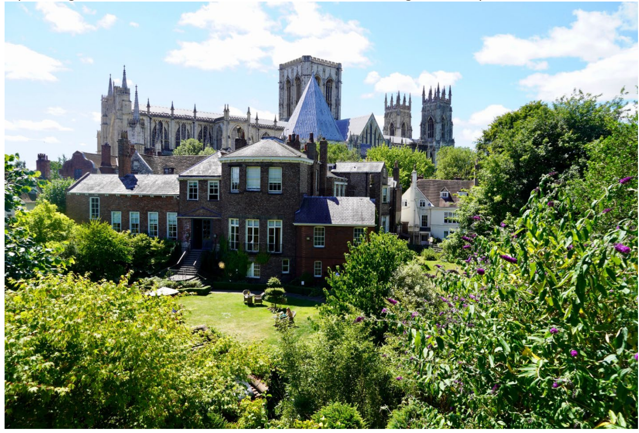
Grays Restaurant and Hotel backs up to the City Wall. Cathedral in background of photograph.