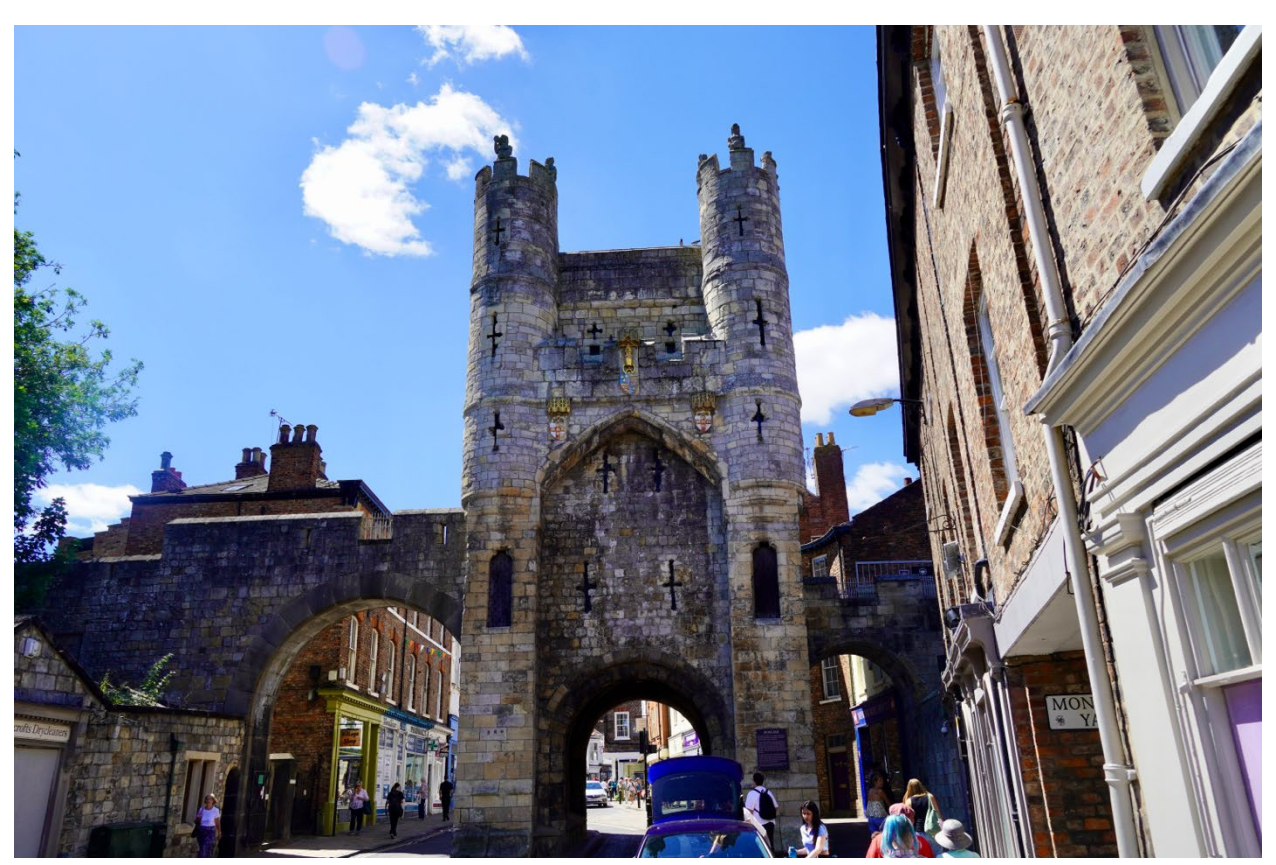
This side of Monks Bar was outside the city whereas the other side was within the city walls.

The city wall fortifications consisted of two sections of wall, one swamp, and one lake (for the king to fish). The stone wall is very narrow and not particularly high. However, most the stone wall is built on top of a previous dirt mound fortification so that from outside an opposing army was looking at 20' of a very steep dirt incline and then 10 to 15 feet of stone wall. This made it very difficult to bring siege machines close to the wall and almost impossible to lean a ladder against the wall. I wouldn't want to be part of an attacking force.