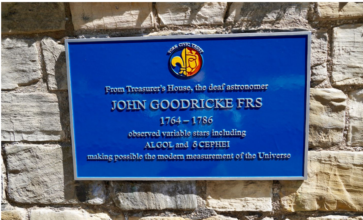
Throughout the city are plaques celebrating the accomplishments of the citizens of York.