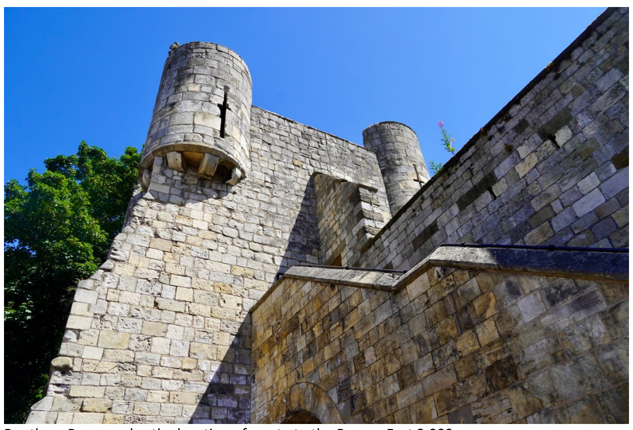
Bootham Bar was also the location of a gate to the Roman Fort 2,000 years ago.