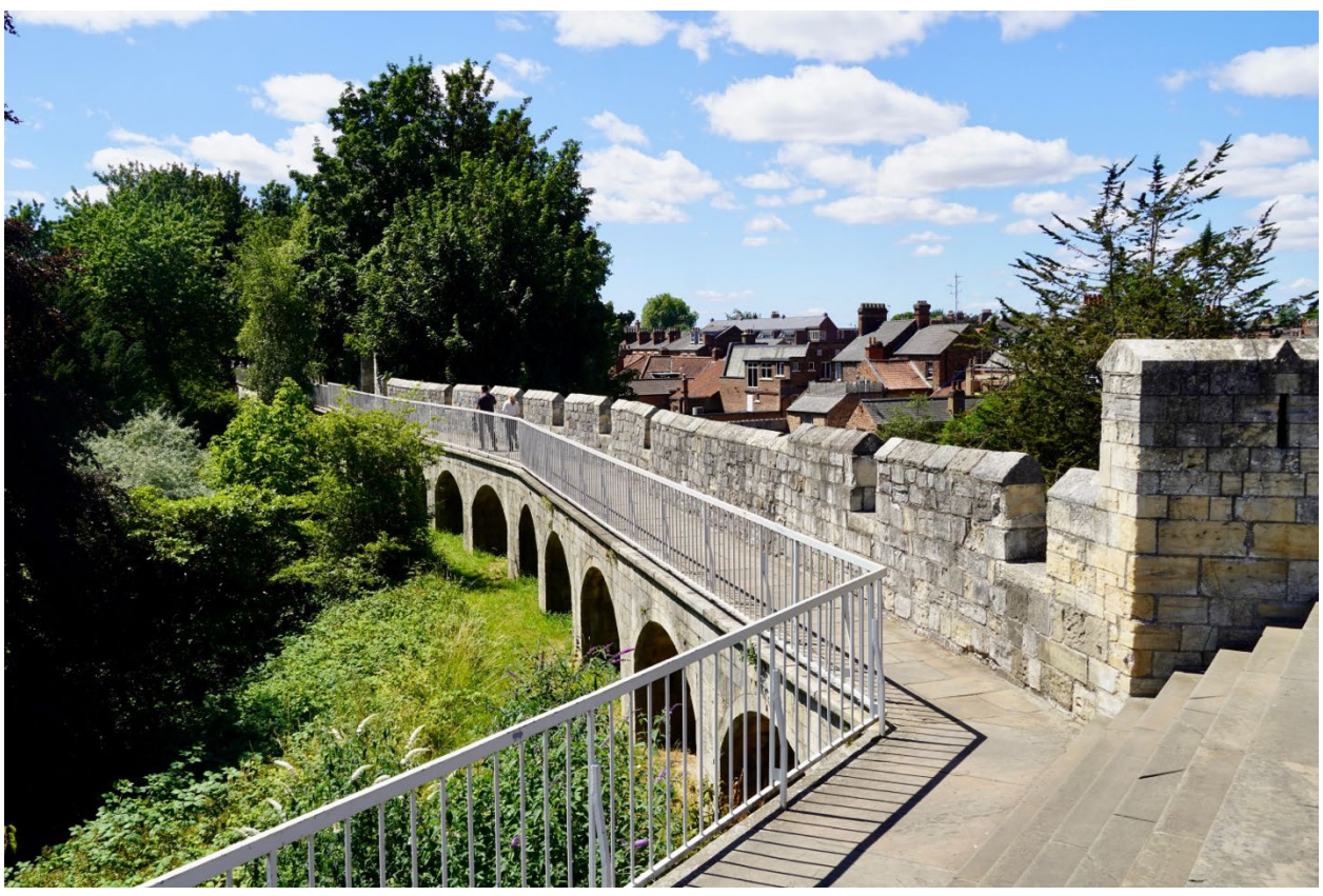
Below: cutting the grass beneath the city wall by remote control.