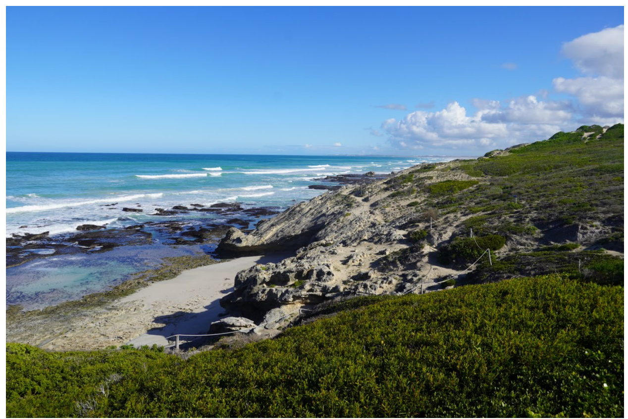
This ocean is the Indian Ocean and although the Indian is warmer than the Atlantic no one bother to test the temperature of the water by wading much less jumping in.