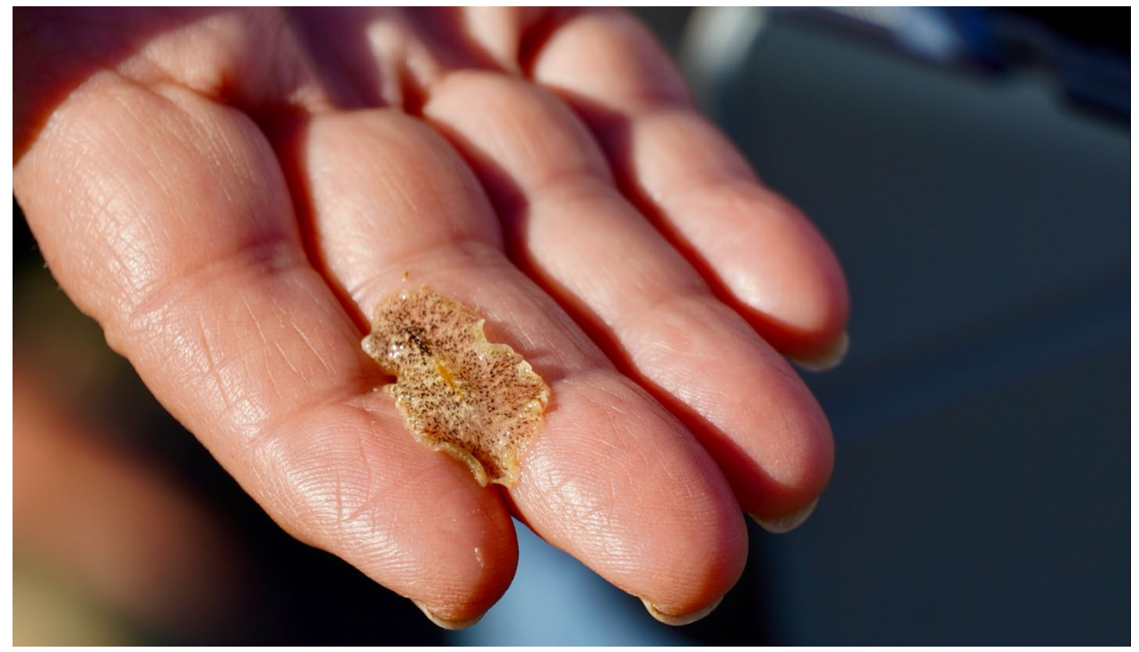
No that isn't a mineral or stuck together sand, it's a marine flat worm of the ocean.