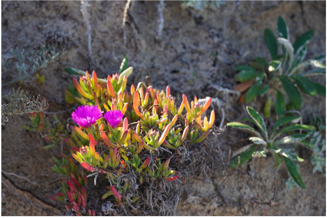
And there were various flowers.