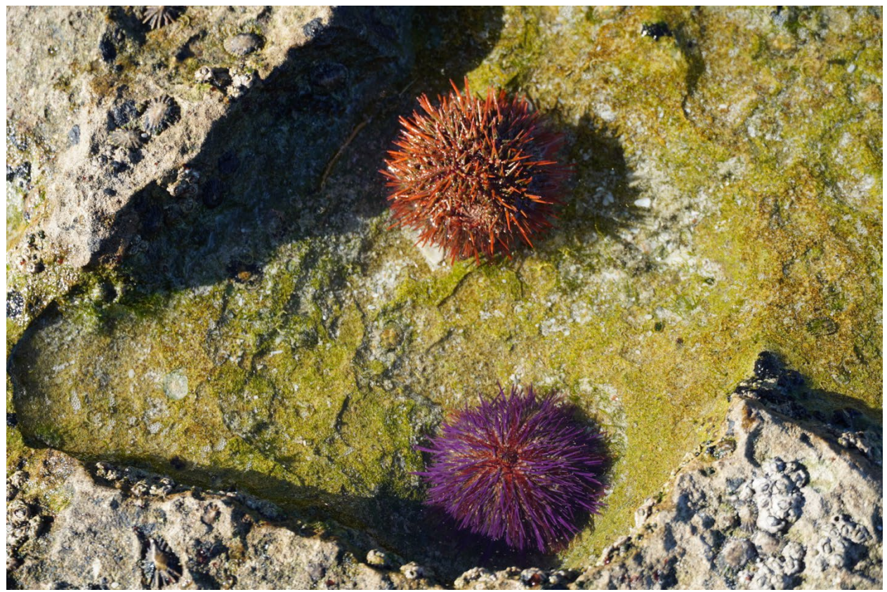
These were the first sea urchins our guide found.