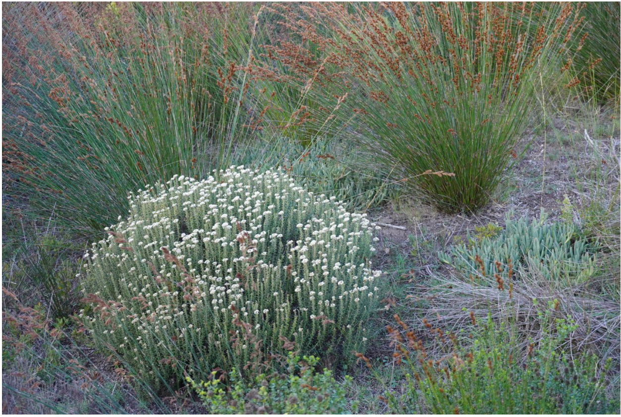
Inland from the ocean and sand there are many different plants. This one was flowering.