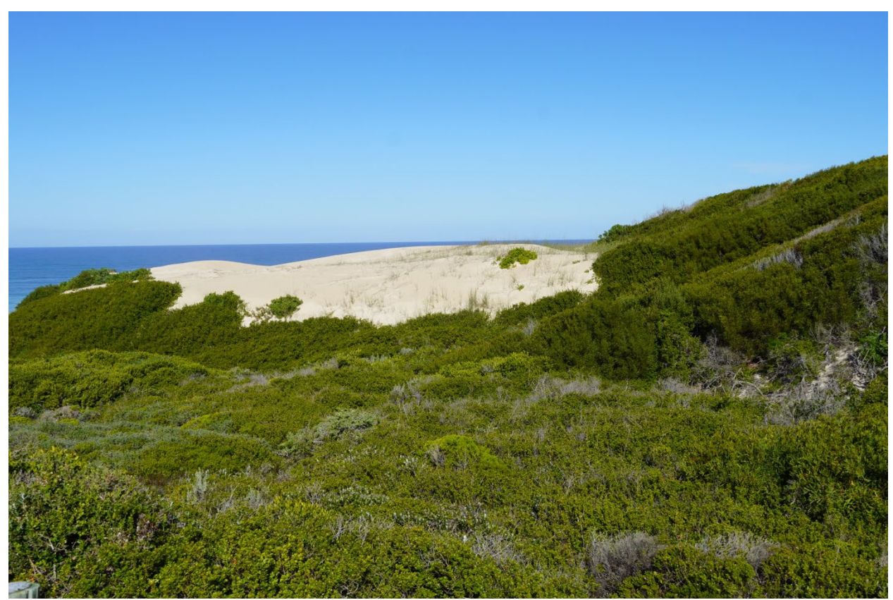
The dunes are slowly encroaching upon the coast plants.