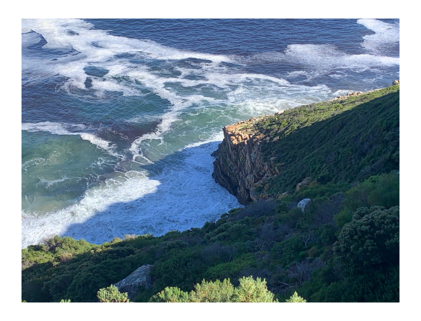
OK, I cheated on the last two photograph and used a telephone lens to bring the views in close.