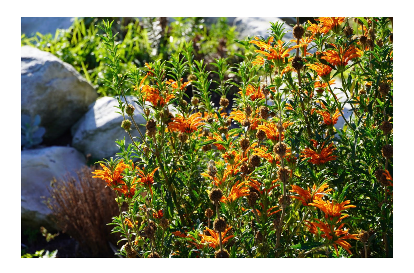
It's winter in the Southern Hemisphere but there are flowers blooming.